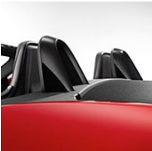
ROLL OVER PROTEC- TION BARS